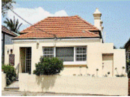
Macau Cultural Center 244 Umwins Bridge Road Sydenham